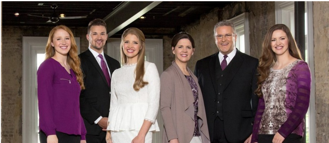
Prayer of Benediction